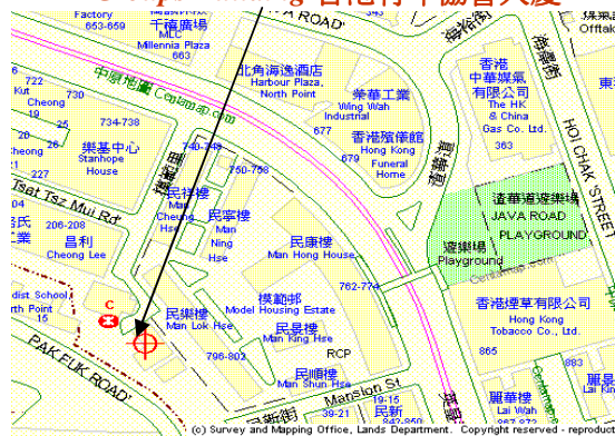
鯽魚涌地鐵站模範里C出口 Quarry Bay MTR Station Exit C

Venue: The Hong Kong Federation of Youth Groups Building 香港青年協會大廈